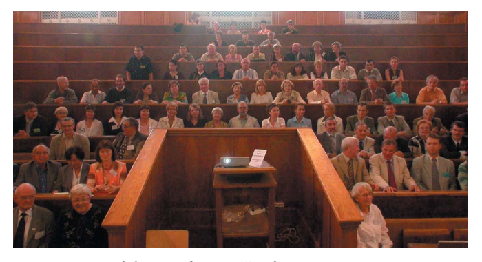
Participants of the Landscape Conference in Moscow