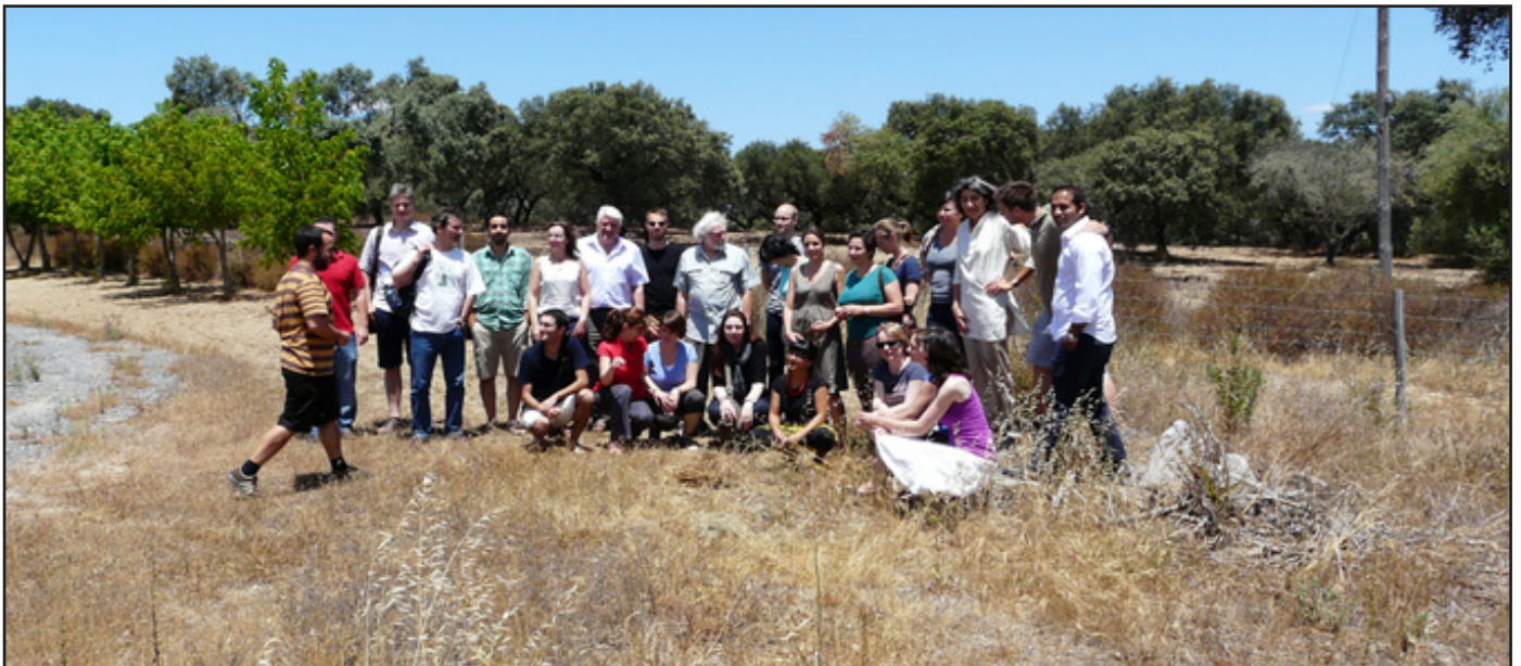
The course took place at premises of the University of Évora, 8 km away from the city, and completely surrounded by the Montado landscape.