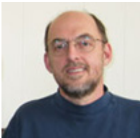
Dr. David Mladenoff

since 1994, studies the ecology and management of forested ecosystems. He and his students take a broad view of forests systems and study a range of topics including forest landscape modeling of land use and climate change effects, analysis of the effects of forest management practices and natural disturbances on ecosystems, the influence of landscape-scale factors on wildlife populations, and effects of land use and historical factors on current landscape patterns and ecosystem processes. "Few others have maintained such diverse research programs, and given current trends, likely few will achieve this breadth in the future" reports Robert Scheller from Portland State University.