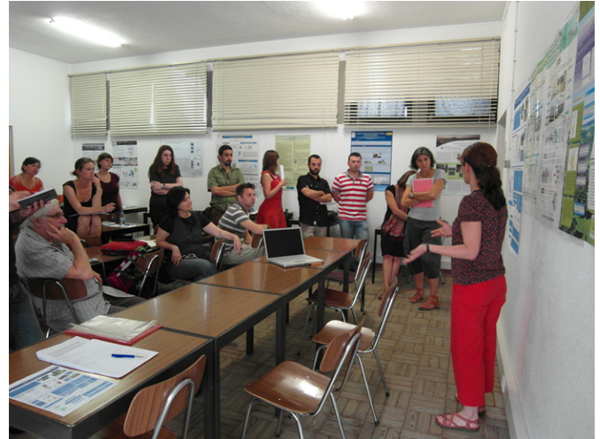
During the poster session on the first day young researchers gave a quick overview on their research topic.

"Every new thought opens new ways." Eva Berrova