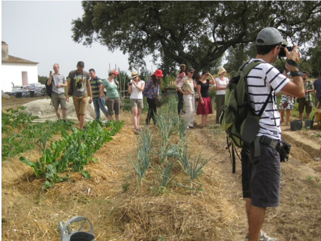
On the last stop on the fieldtrip the group met with young farmers that recently engaged in permaculture.

Despite extreme weather conditions (43°C), also the fieldtrip into the Alentejo landscape was very much appreciated. During the day the group met farmers and other stakeholders to discuss their responses to global issues driving agriculture as policies, food safety, climate change or energy, and the simultaneous need to sustain competitiveness of the agricultural sector, guarantee higher standards of food production and meet emerging societal demands.