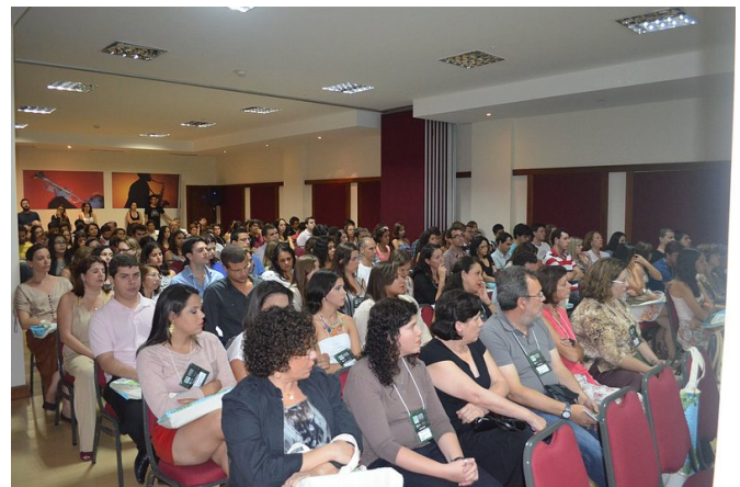
Audience at the II. Brazilian Congress of Landscape Ecology.