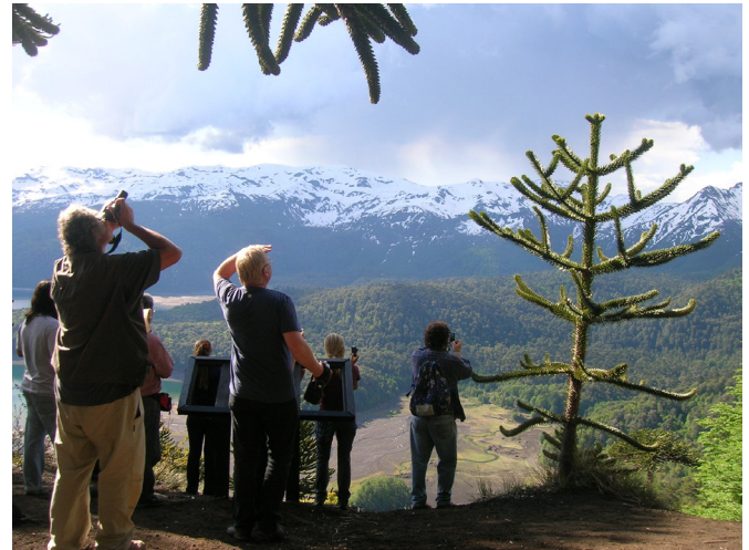
Post-conference field trip to Conguillio National Park in southern Chile.