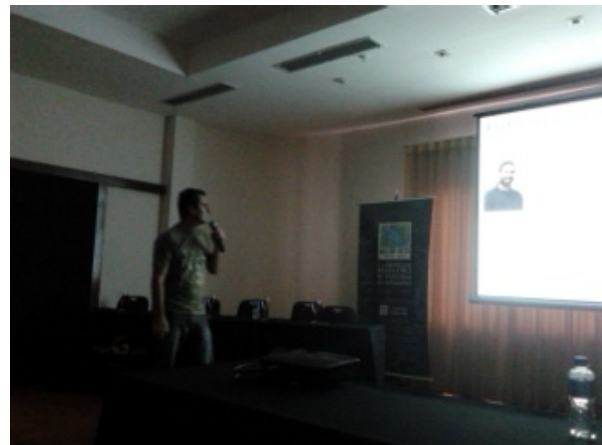
Impressions from the II. Brazilian Congress of Landscape Ecology (Photos: local organizers).