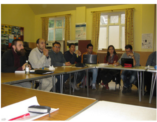
Sessions in Hathersage that took place in the Methodist Church Hall

Following some comments from young researchers on their experience in Manchester and Peak District: