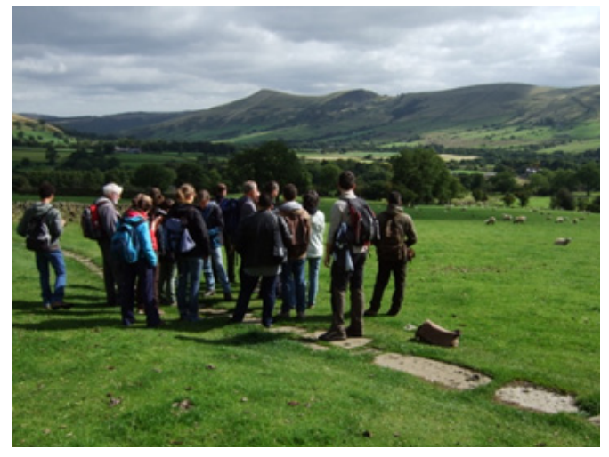
Specialists from the National Park led the much-appreciated fieldtrip into the Peak District landscape

The presence of seven of last year's students actively participating in this year's conference, by presenting papers, organizing a symposium and collaborating in the administrative issues of IALE-Europe is an evidence of the relevance of organizing the PhD courses as way to ensure the vigor and prosperity of the IALE community.