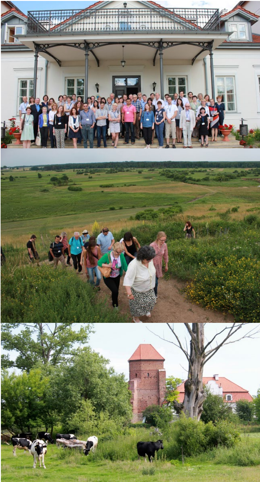
Picture above: Participants of the conference In the middle: Who said that it must always be downhill Picture below: The cultural landscape of the Polish Mazowsze

The organization of the conference was partially funded by The National Center for Science on the basis of a decision DEC-2012/07/B/HS4/00306; the project "Use of the ecosystem services concept for sustainable management of tourism in lake areas"