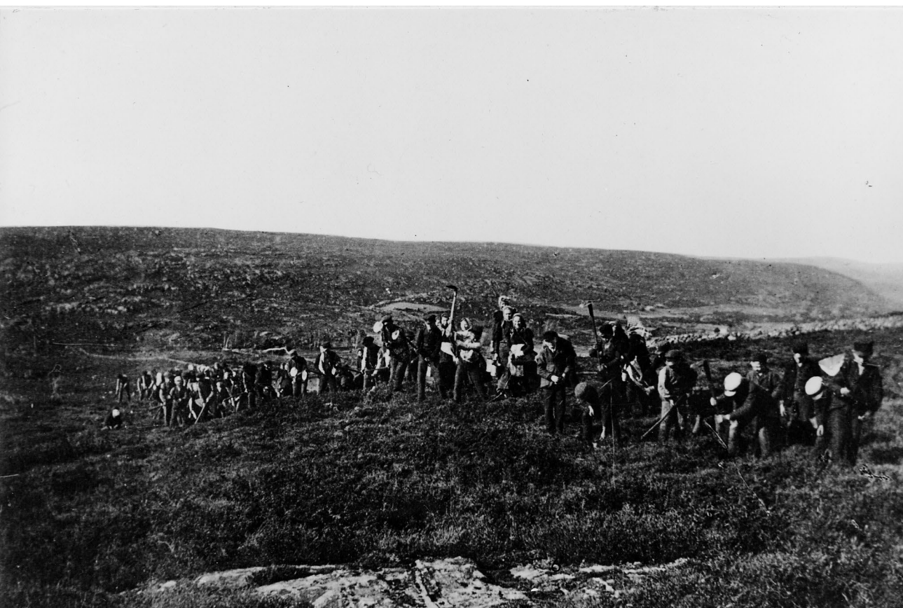
Text next to photo: The southwestern part of Sweden was to a large extent covered by deciduous forest ( Quercus robur and Fagus sylvatica ) until the 17th and 18th centuries when it was transformed to pasture and low-productive calluna-heath. In the late 19th century active forest regeneration took place to convert these open heathlands to forests again, but now converted to coniferous forest. In this picture local schoolkids are planting Norway spruce ( Picea abies ) seedlings in May 1900 in Valinge parish, on the west coast in Sweden.